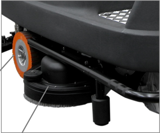
Polyurethane non-marking wheels