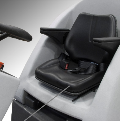
Comfortable operator seat